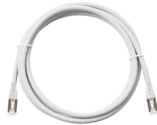
Ex. US-5201SLZ-1 : Shield CAT6A RJ45 to RJ45 Patch Cord, LSZH, White, 1 meter