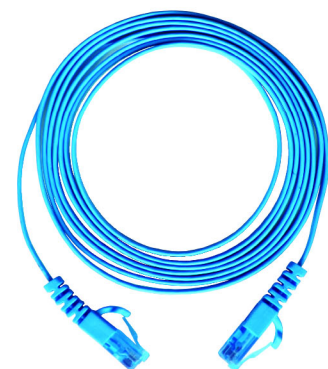
FLAT CAT6 RJ45 to RJ45 Patch Cord