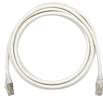
Shielded CAT6 RJ45 to RJ45 Patch Cord,LSZH