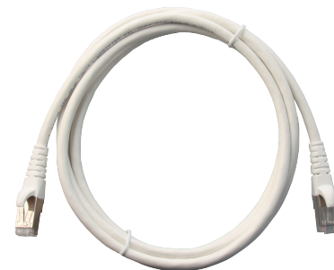
Shield CAT6 RJ45 to RJ45 Patch Cord