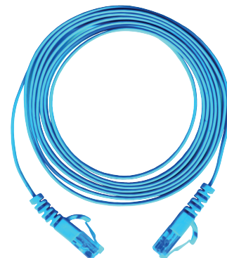
FLAT CAT6 RJ45 to RJ45 Patch Cord