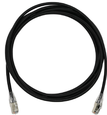
Shielded CAT5E RJ45 to RJ45 Patch Cord,LSZH