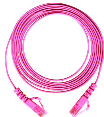
FLAT CAT5E RJ45 to RJ45 Patch Cord