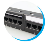
Push Flip Label