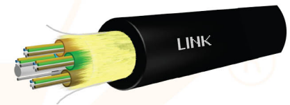
OUTDOOR/INDOOR, Multi Tube UFCX3XXM