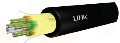
OUTDOOR/INDOOR, Multi Tube UFCX3XXM