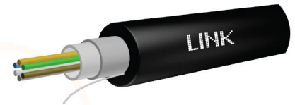
OUTDOOR/INDOOR, Single Tube UFCX3XX