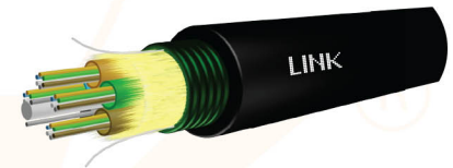
OUTDOOR/INDOOR, Armored, Multi Tube UFCX3XXMA