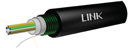
OUTDOOR/INDOOR, Armored, Single Tube UFCX3XXA