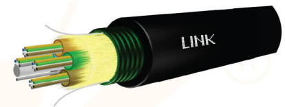
OUTDOOR/INDOOR, Armored, Multi Tube UFCX3XXMA