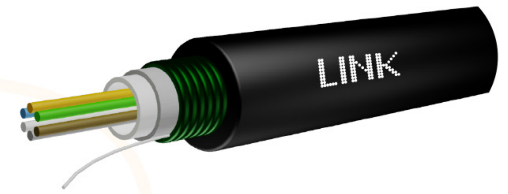
OUTDOOR/INDOOR, Armored, Single Tube UFCX3XXA