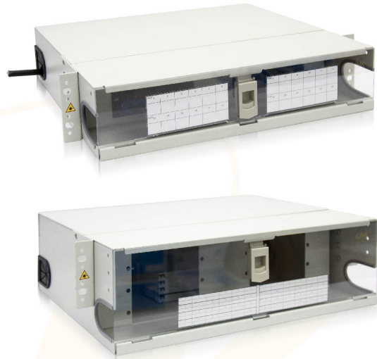
RACK MOUNT FIXED