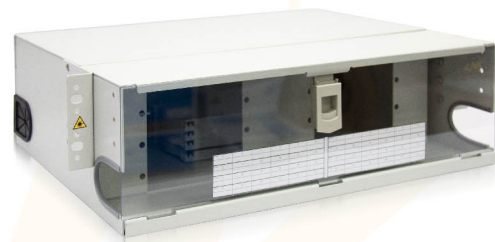
RACK MOUNT FIXED