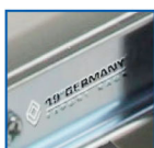
19" GERMANY Sliding Rail