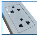
Safety Shutter TIS Outlet