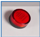
LED Pilot Lamp