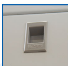
Slide Latch w/logo