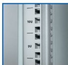
Mounting Pole w/screen UH