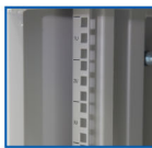
Mounting Pole w/Screen UH