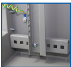
Mounting Pole Can be Adjustable