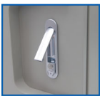
Push Handle Lock