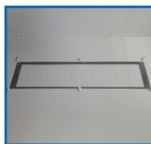
3 Knock Out Holes