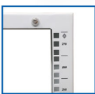
Mounting Pole w/Screen UH