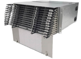
DC-2104 Extreme Hi-D, 4 U, 576 Core