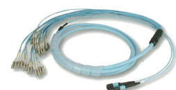
MPO-LC TRUNK HARNESS CABLE