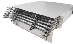
DC-2102 Extreme Hi-D, 2 U, 288 Core