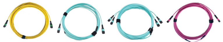
MPO-MPO TRUNK CABLE