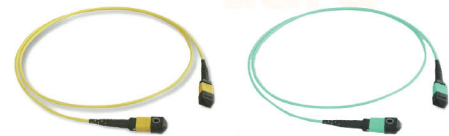
MPO-MPO ARRAY CABLE