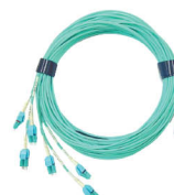
MPO-LC ARRAY CABLE