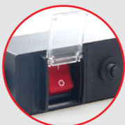
Lighting Switch w/Guard