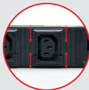
IEC320 C13 Outlet w/Lockable