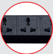
Universal Outlet w/Eye Shutter