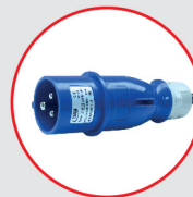
Industrial Power Plug IEC 60309, IP44 (16A & 32A)