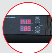
Volt - Amp Meter w/Alarm