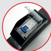
Circuit Breaker w/Guard