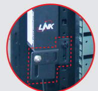
Vertical Mounting w/PDU Bracket Kit